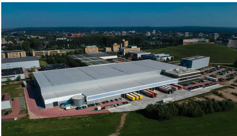
New warehouse Bunzl